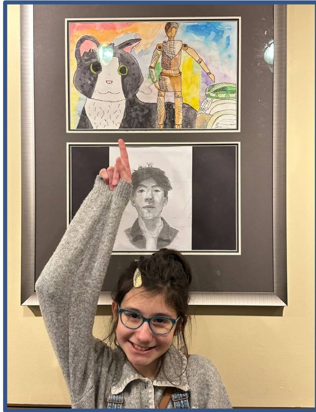
Chloe Negro still life