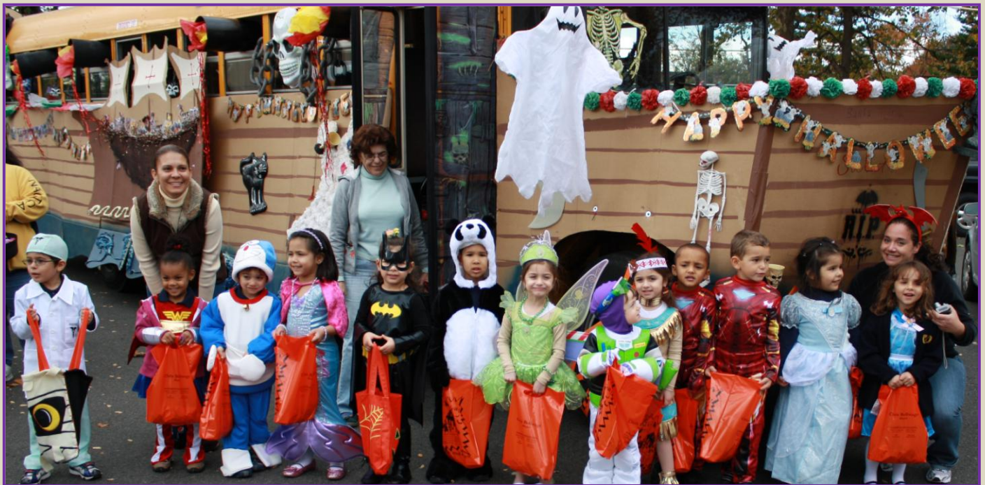
Students from Victor Mravlag School No. 21 @ 31 enjoy their “Trunk or Treat” celebration!