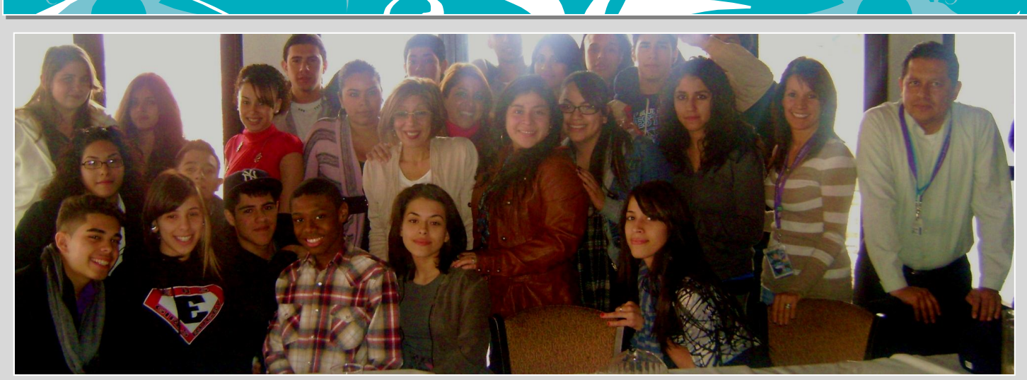
Language and Culture Experience at Aroma Restaurant

Spanish I and II students from the Thomas Jefferson Arts Academy had a wonderful language and cultural experience at Aroma Restaurant in Elizabeth. During the field trip, students had the opportunity to order from the menu in Spanish; taste different Spanish recipes; converse with restaurant staff; and dance to Spanish music. The trip was a wonderful way for the students to practice their Spanish speaking skills and experience Spanish culture.